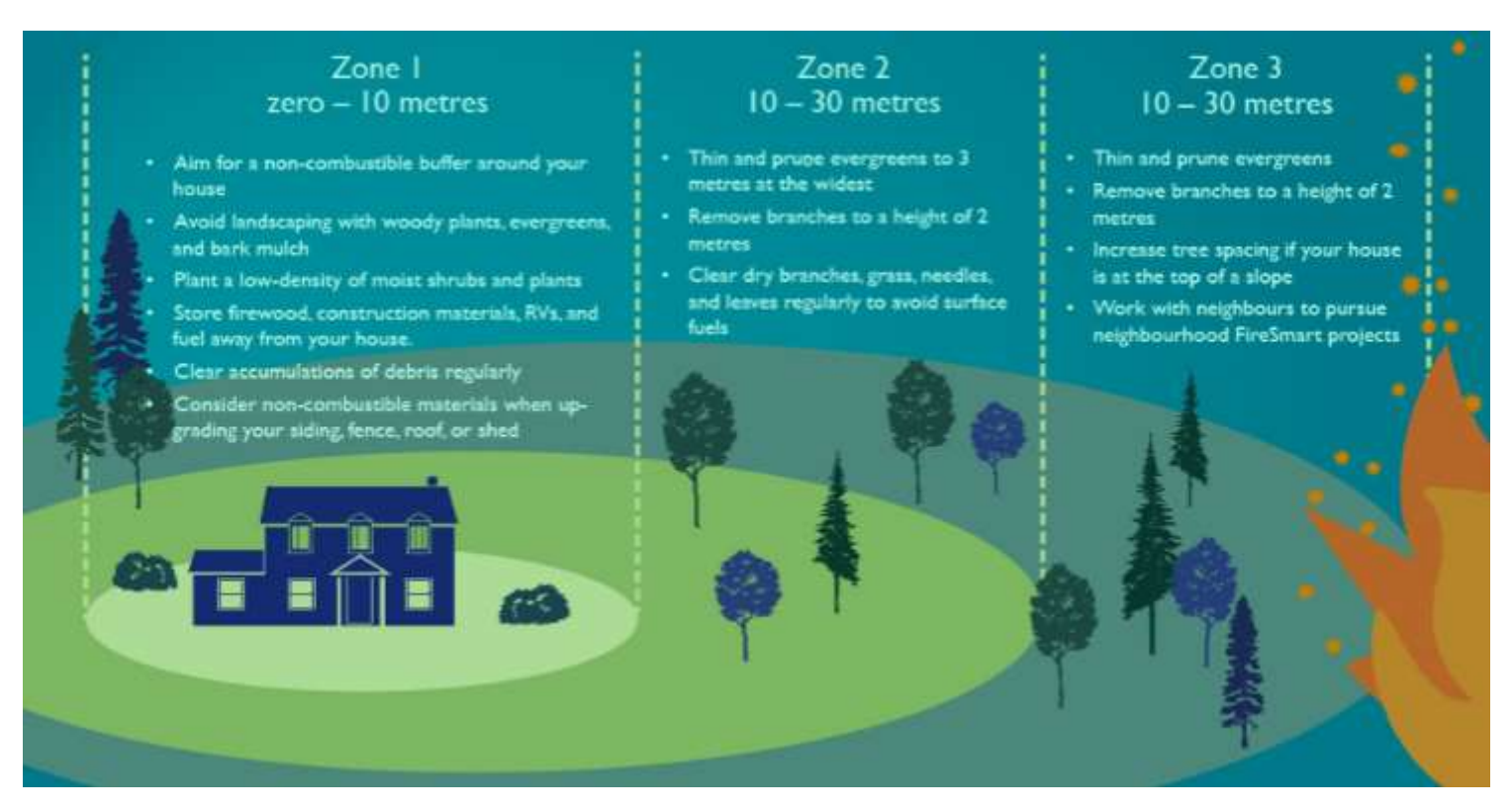
An example of a fire-smarting strategy promoted by the City of Whitehorse, Yukon

The figure below shows a fire-smarting strategy for three zones, based on the distance from the house.