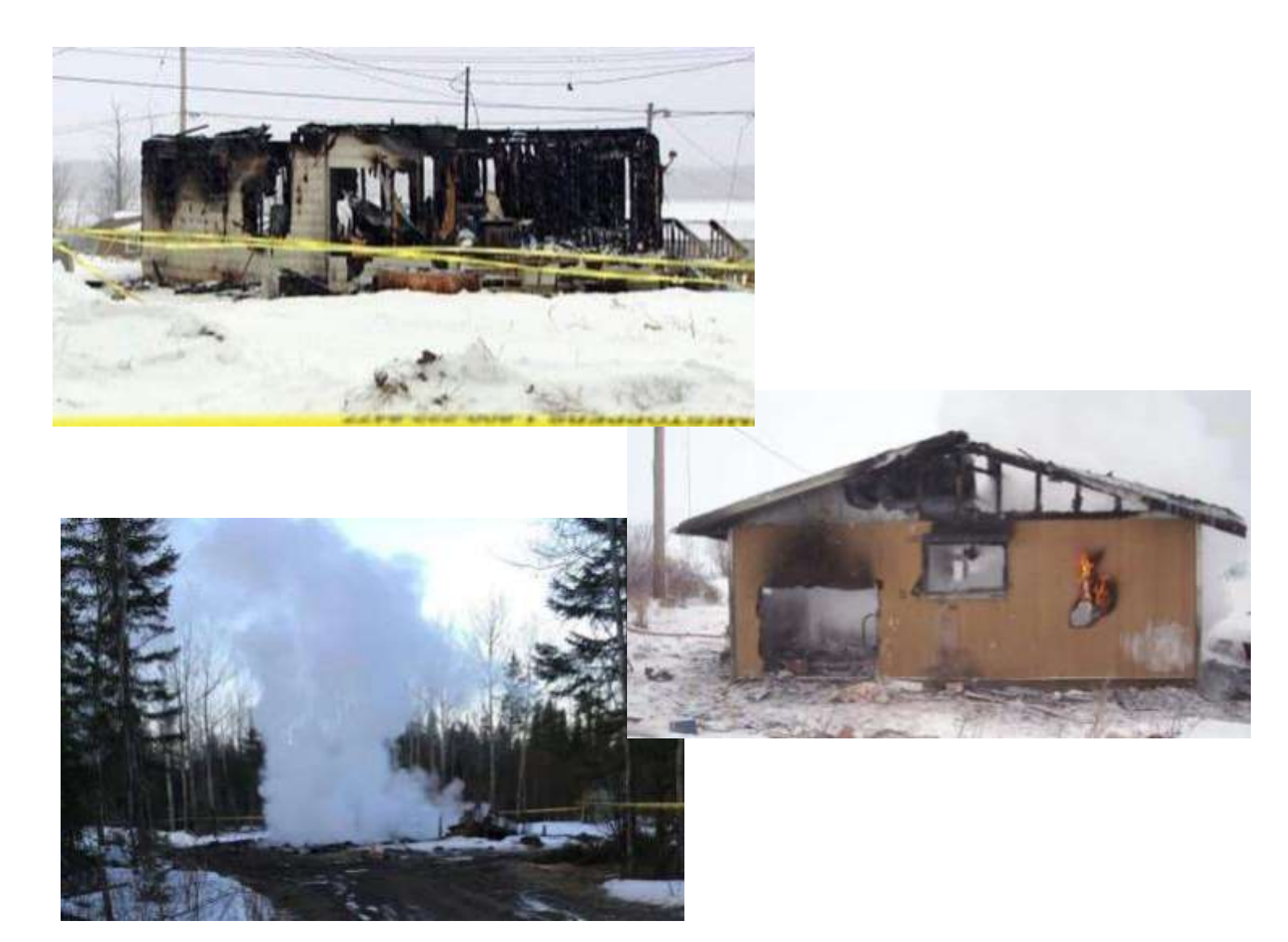
Fires in northern Ontario homes that spread from chimney fires during winter nights

Tragically, these fires are extremely deadly, as the smoke and fumes from the fire typically expose the occupants in the house to carbon-monoxide poisoning as they sleep, preventing them from waking up.