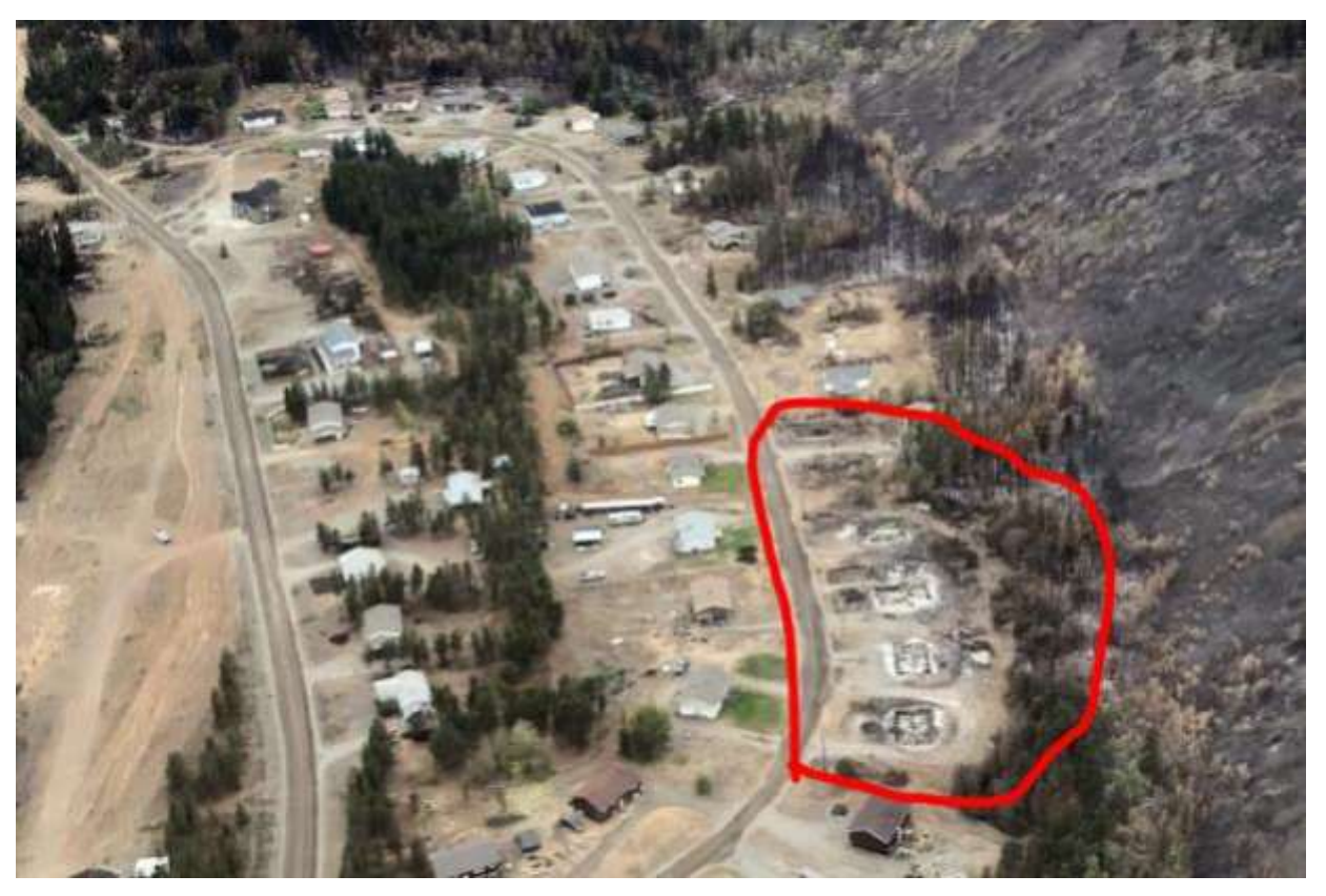
A group of houses (circled in red) destroyed by a forest fire in the summer months

Forest fires have the potential to burn through northern communities and destroy all or most of the community's housing. Materials used in house construction matter. There have been cases in which some houses in a community burn and others don't, even though both homes were exposed to similar heat and sparks from a forest fire. The reason is simply that they are built with different materials. Building a house with certain construction materials, such as a metal roof instead of asphalt shingles, greatly reduces the risk of a house catching fire from the airborne sparks of a nearby forest fire. Using metal, cementitious siding or charred wood siding instead of vinyl siding has a similar benefit. These lower-fire-risk materials are discussed further in Booklet #7.