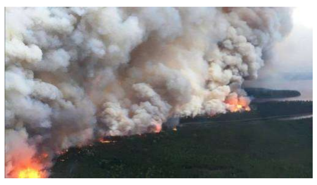
A large forest fire